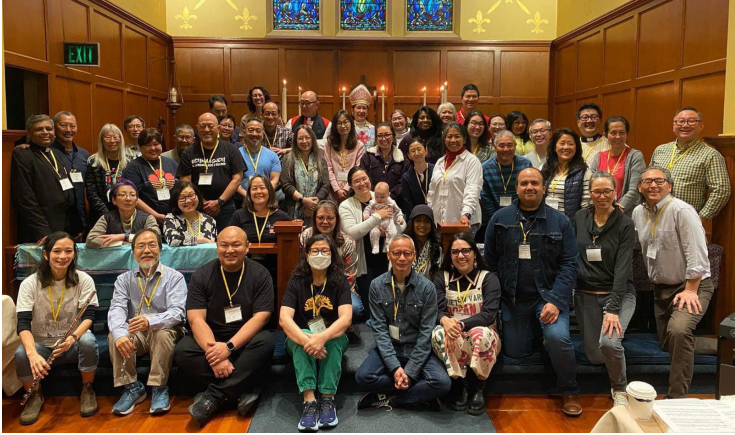
AAPI gathering in Oregon!