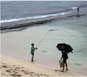
I'm fishing in the rain!