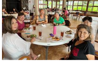
Fun get together at camp