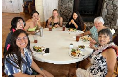
Hula halau members!