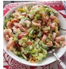
Susan's shrimp salad!